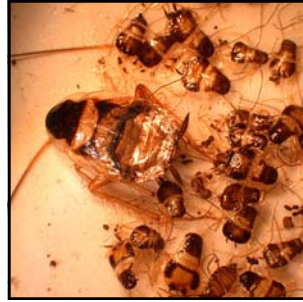
Brown Banded Cockroach