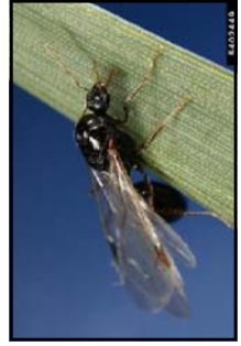
Carpenter Ant