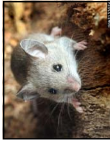
Deer Mouse