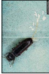
Powderpost Beetle