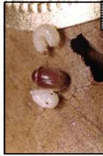
Cigarette Beetle